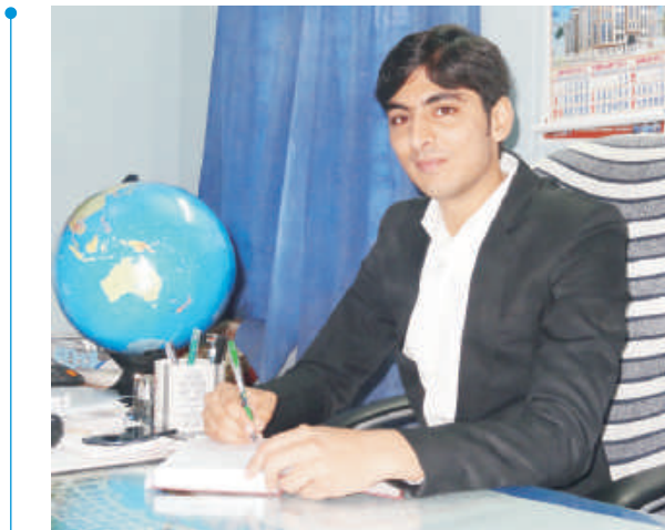
Message from the Correspondent

Present day education develops the intellect and skills but does little to develop good quality. After making an elaborate study of congenial environment required in the field of education, in the present world full of challenges, this dream project of starting a Global School apart from the existing intendentaward with all the essential facilities and modern methods of learning is visualized.