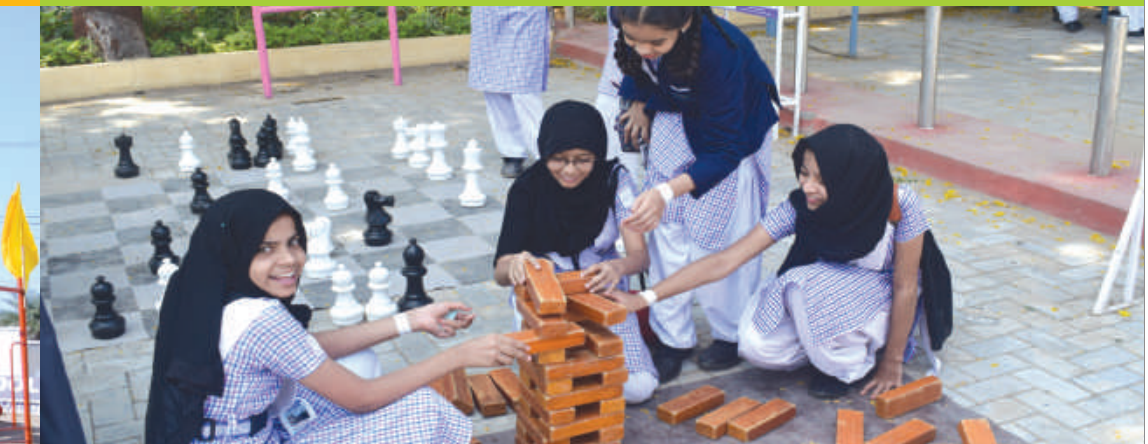
AIM HIGH, CAN DO... BELIEVE IN ONESELF