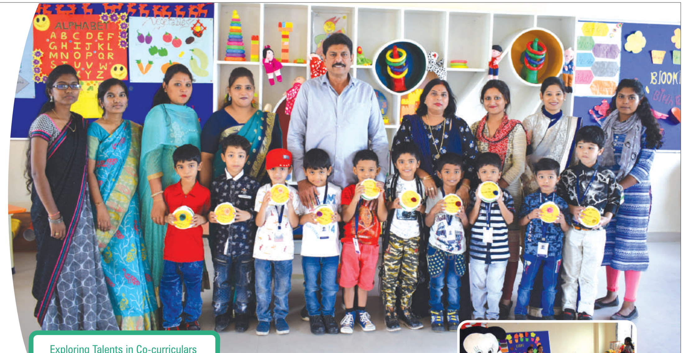
Exploring Talents in Co-curriculars

Spacious, Ventilated and well designed building named as 'C' Block has been constructed, beside the main building, Exclusively for boys with all the modern facilities to enhance the learning process. The infrastructure shall inculcate interest and enthusiasm among the students. This spacious and well ventilated block enhances the learning enthusiasm and capacity.