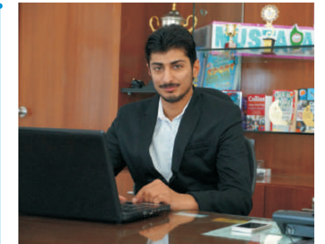
Message from the Vice-Chairman