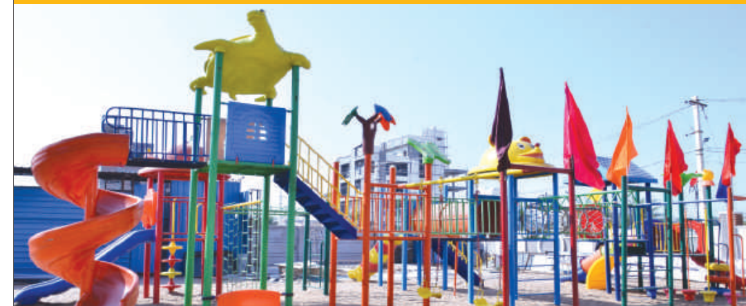
BELIEVE & ACHIEVE / KEEP TRYING TO BE FIT AND DON'T QUIT