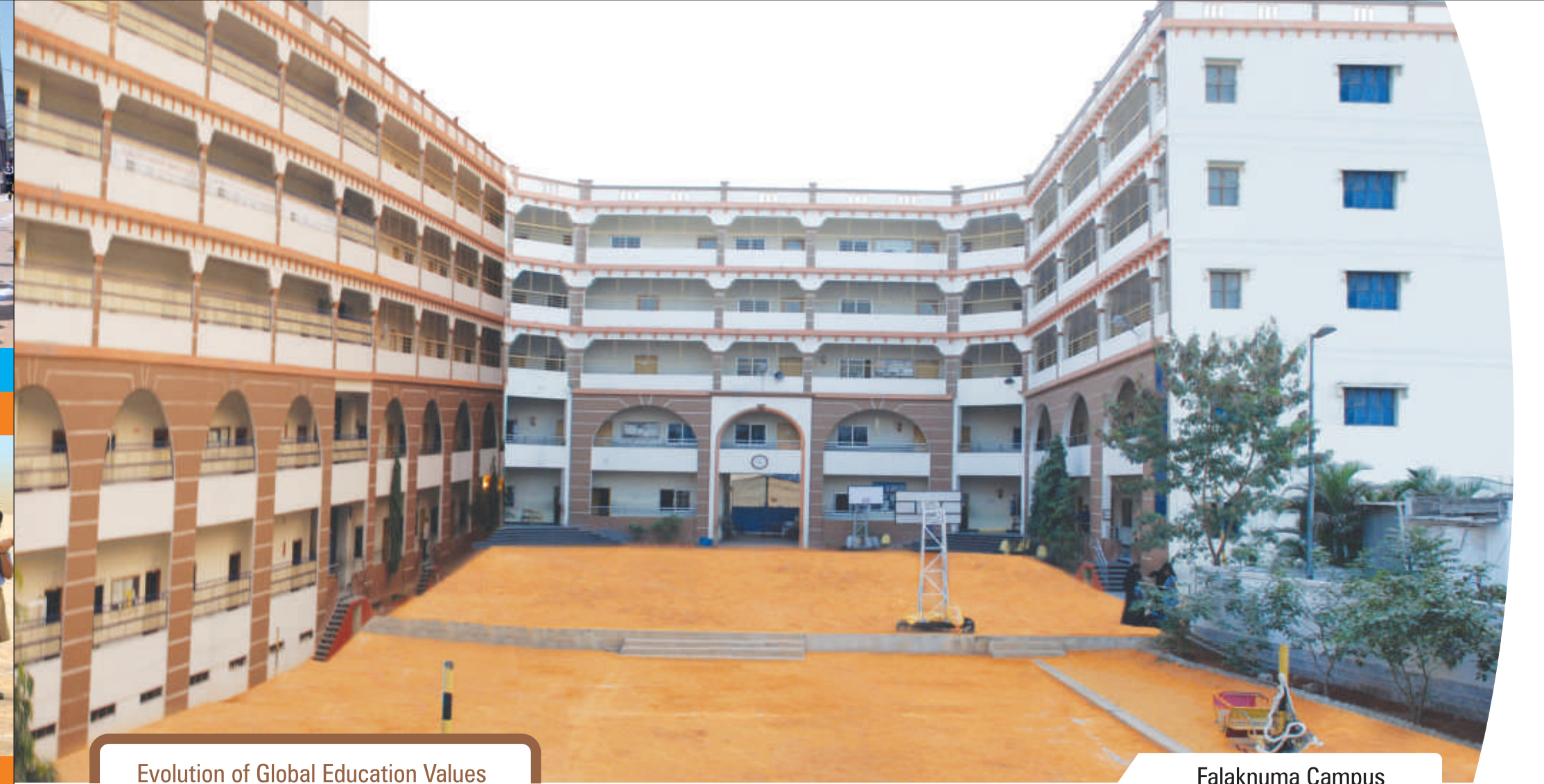
Evolution of Global Education Values