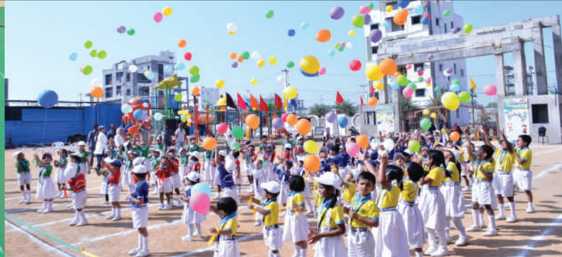
MINI SPORTS DAY JUNIOR ON THE MOVE...