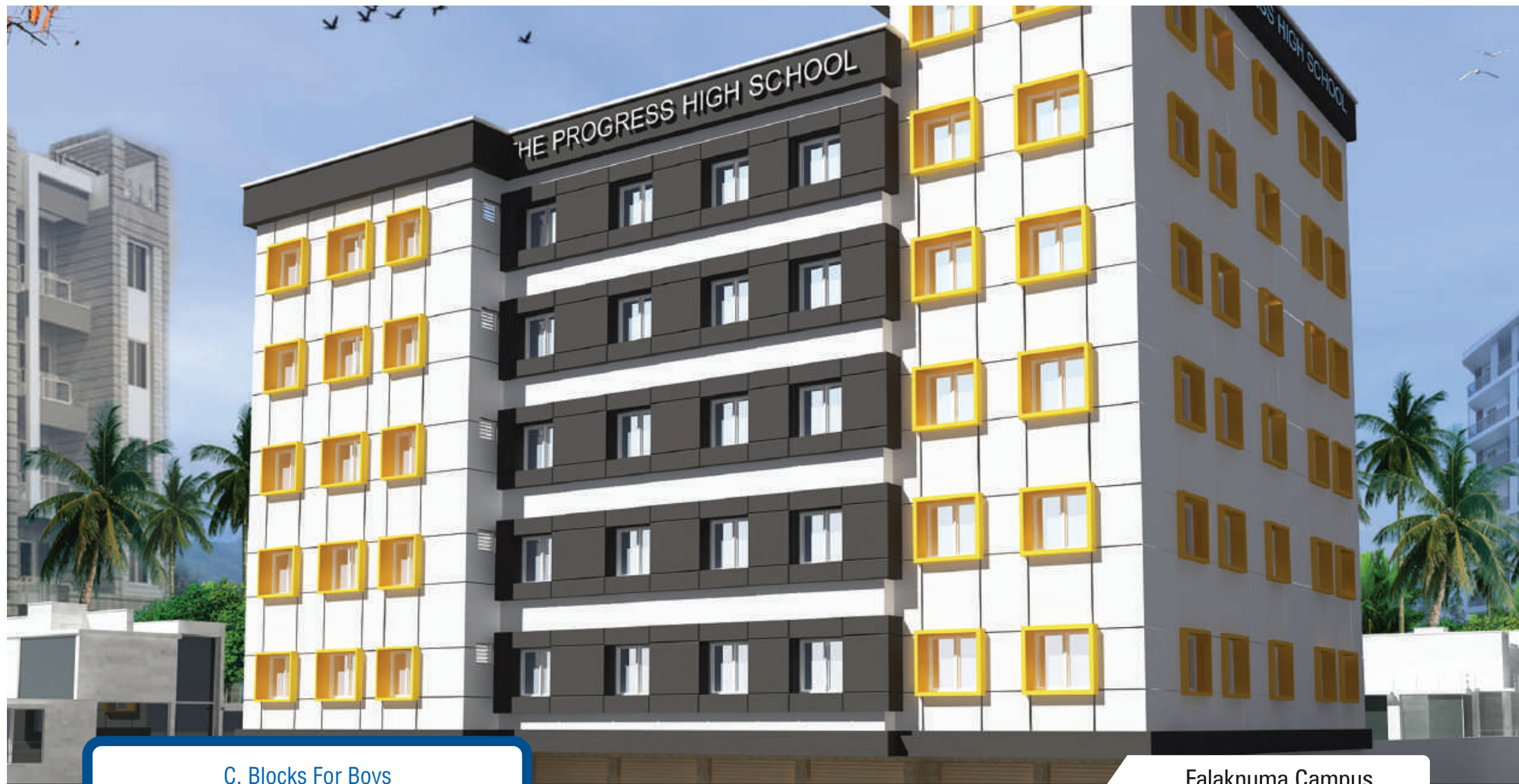
C. Blocks For Boys