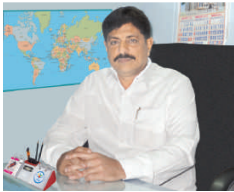
Message from the Chairman

As a founder and chairman of Progress Group of Institution, it is indeed a profound opportunity and distinct privilege to serve in the noble cause of imparting quality education to our children.